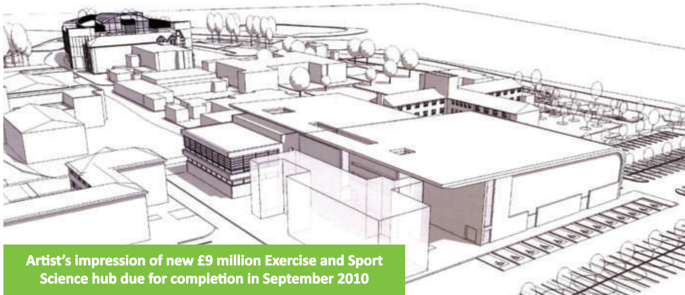
Artist's impression of new £9 million Exercise and Sport Science hub due for completion in September 2010